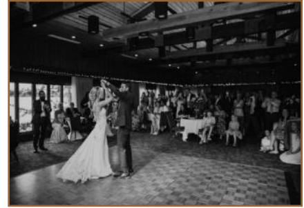
Wilson Bay Lodge | Max Capacity 200