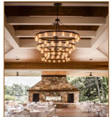
The Pavilion | Max Capacity 250