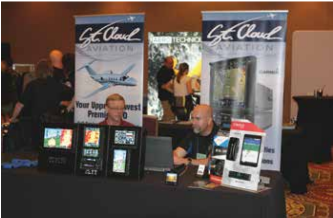
St. Cloud Aviation and Park Rapids Aviation were among the many exhibitors at the Minnesota Seaplane Pilots Safety Seminar. The principle sponsor of the seminar was Wipaire, Inc.