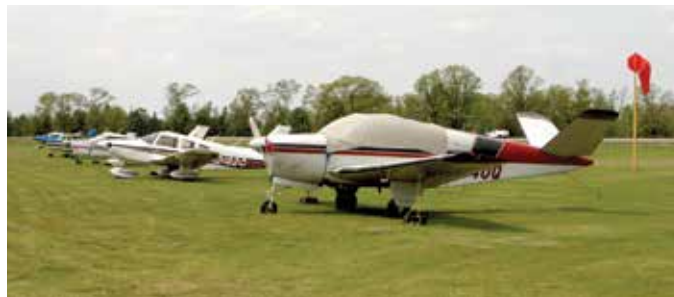
Aircraft parked along the grass runway at East Gull Lake Airport (9Y2), located adjacent to Madden's on Gull Lake, Brainerd, Minnesota.