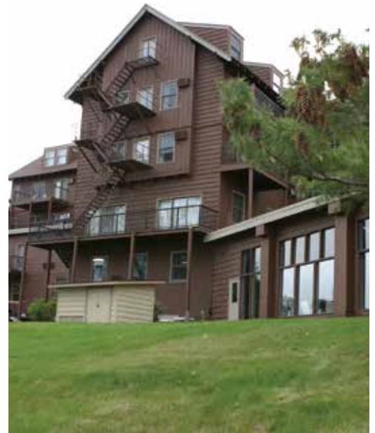
One of many majestic structures at Madden's on Gull Lake, Brainerd, Minnesota.

The purpose of the Minnesota Seaplane Pilots Association is to promote seaplane flying and safety programs pertaining to seaplane operations throughout the state; promote a forum for the purpose of approaching government officials, to educate them, the legislature and the public on seaplane operations; and create safe and compatible seaplane base facilities throughout the state of Minnesota ( www.mnseaplanes.com ). □