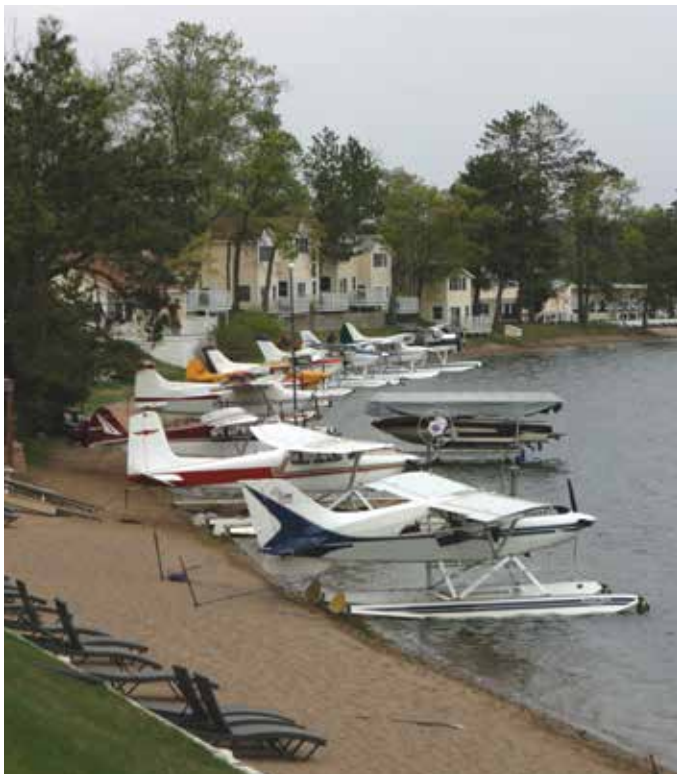
Seaplanes lined the shore at Steamboat Bay Seaplane Base (M16) at Madden's on Gull Lake, Brainerd, Minnesota.