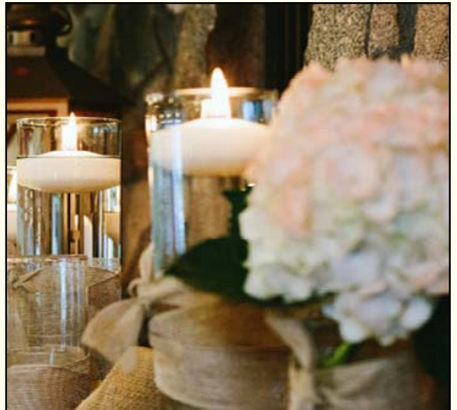
Town Hall Capacity 500