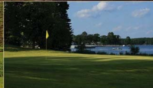
Pine Beach East